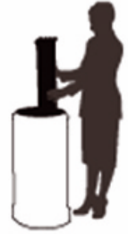
Aluminum Frame set of magnetic bars Halogen Lights

1. remove frame and graphics from the case. lights are stored in lid.